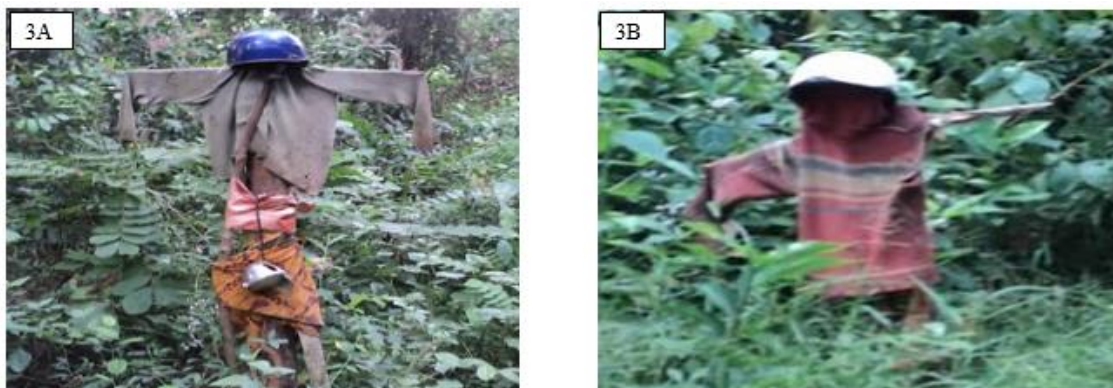
Plates 3A and 3B: Scare crows in Okomu National Park