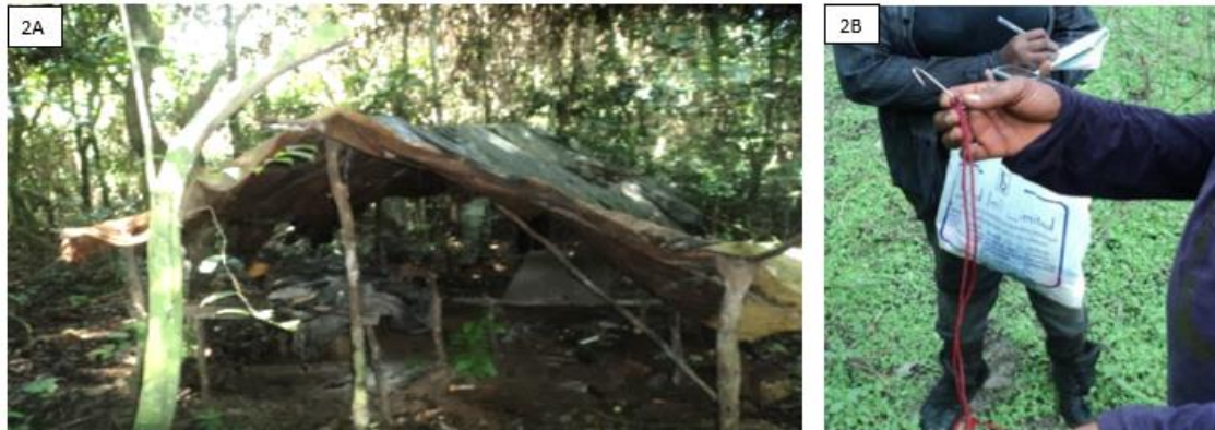
Plates 2A and 2B: Evidence of hunting in Okomu National Park: A) Hunter's hut B) A hook snare