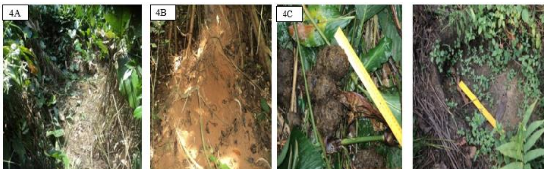
Plates 4A - 4D: Signs of elephant activities in Okomu National Park: 4A – Path created by elephants; 4B – Uprooted tree; 4C – Elephant dung and 4D – Elephant footprint