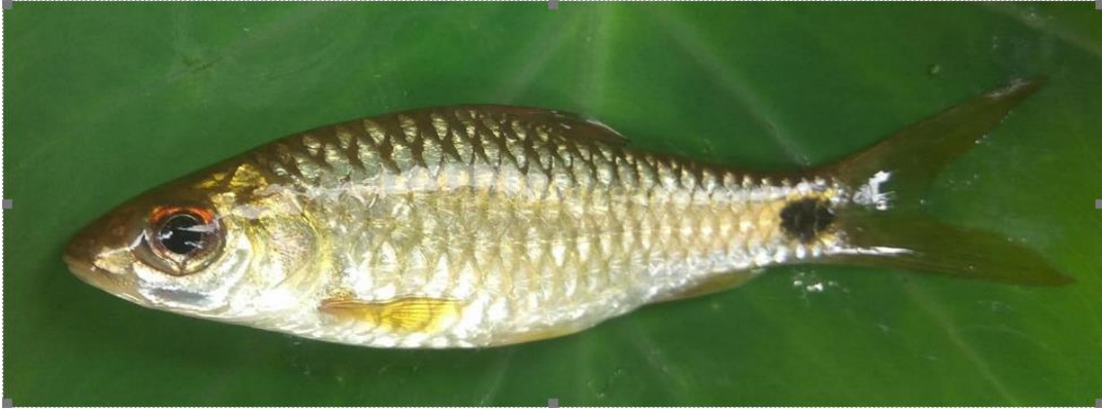
Fig. 1. A fresh specimen of Puntius ocellus , Paratype, ZSI/WRC/P5542.