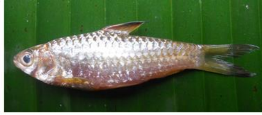
Fig. 7. P. amphibius PCMP 46