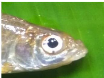
Fig. 4. Head of P. ocellus showing elongated and pointed snout