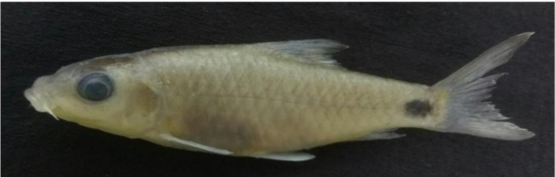
Fig. 3. A preserved specimen of P. ocellus , Paratype, ZSI/WRC/P5542.