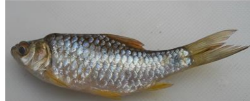
Fig. 9. P. kyphus ZSI/NERC/V/F 4546