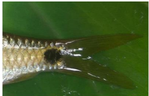
Fig. 5. Tail region of P. ocellus showing golden ring surrounding caudal spot.