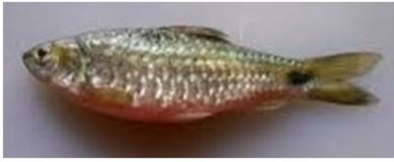
Fig. 6. P. mahecola PCMP 40