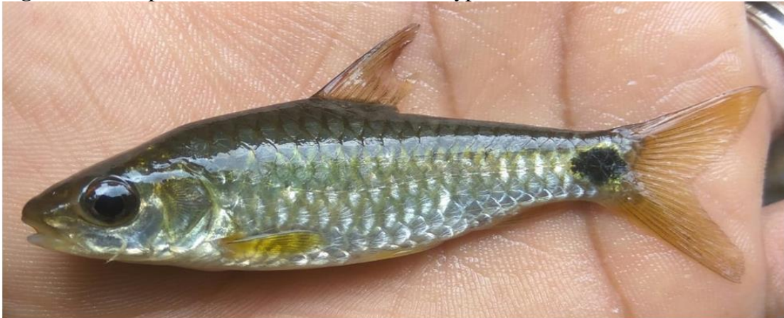
Fig. 2. A fresh specimen of P. ocellus , Holotype, ZSI/WRC/P5541.