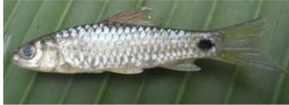
Fig. 8. P. euspilurus FBRC/ZSI/F/2314